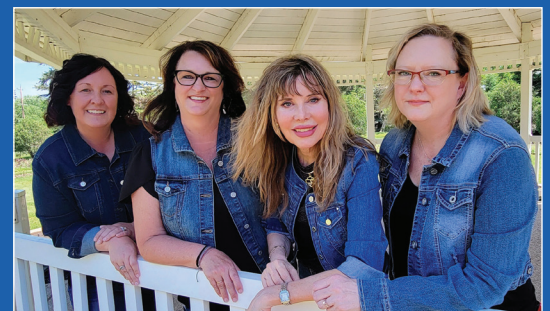
SD PFL TEAM (L-R):

SOUTH DAKOTA PROJECT FIRSTLINE www.SDProjectFirstline.org @ProjectFirstlineSouthDakota